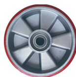
200x50 Polyurethane wheel