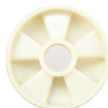
180x50 Nylon wheel