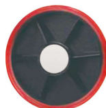
180x50 Polyurethane wheel