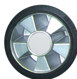
180x50 Rubber wheel