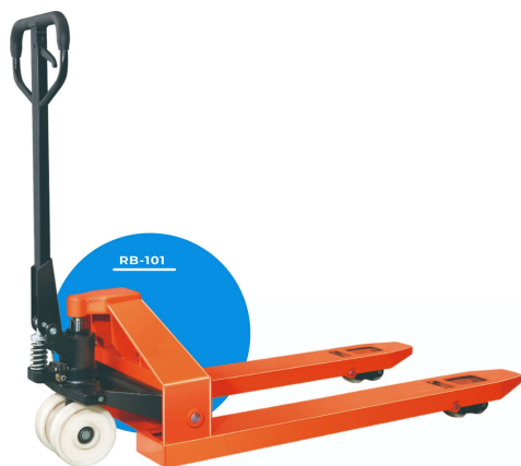
Heavy Duty Type